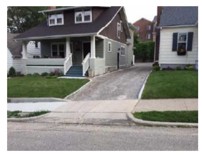
315 and 315 Koch (application photo 2015

The work is generally compatible with the size, scale, massing, and materials and meets the Secretary of the Interior's Standards for Rehabilitation, standard(S) number(S) (circle all that apply): 1, 2, 3, 4, 5, 6, 7, 8, 9, 10