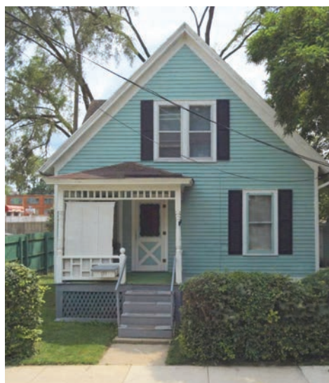
109 W. MADISON ST. RESIDENCE