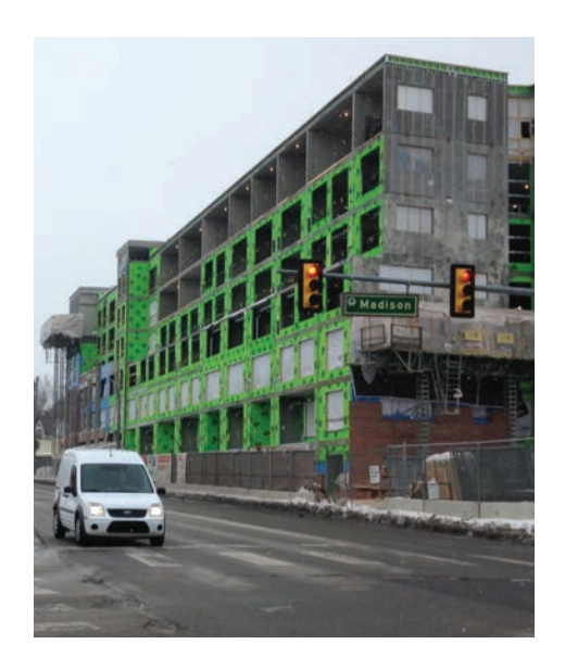
618 MAIN BUILDING