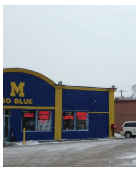
CLARK GAS STATION