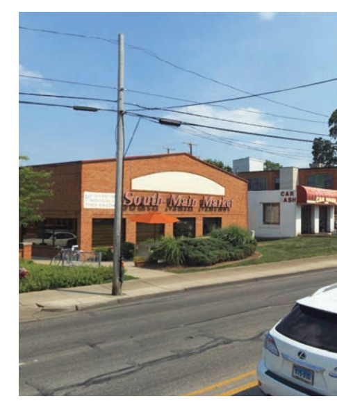
SOUTH MAIN MARKET