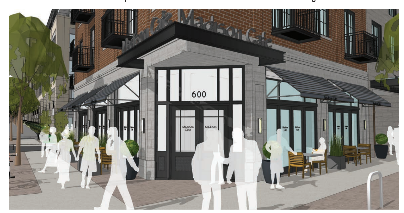
MADISON CAFE/RETAIL ENTRY

The residents of The Madison on Main will enter a secured entry lobby off of Madison Street. The street level residential amenities will include a mail room, concierge, access to heated parking garage levels and a screened solid waste/recycling area. Two exit stairs and one passenger elevator will provide the necessary vertical circulation. The plan includes 24 private off-street heated parking spaces. 12 spaces are located at the mezzanine level and 12 spaces are located below grade. Secure bike parking will be provided for residents at the lower level parking with convenient direct street access. A partial basement level will include mechanical and storage rooms.