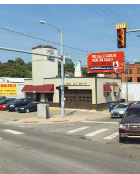
JAPANESE AUTO SERVICE