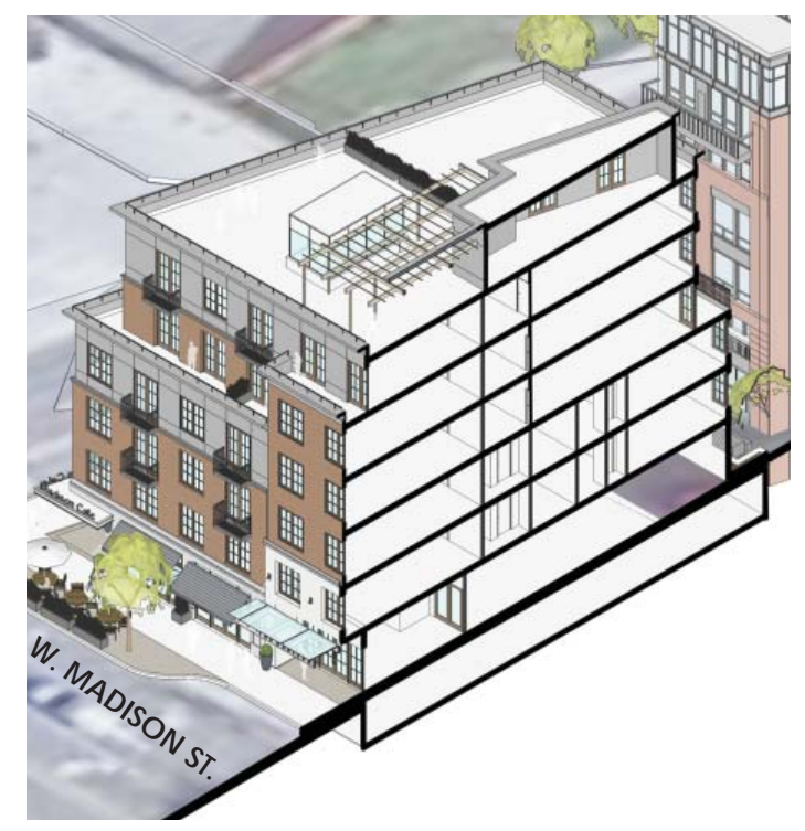
NORTH/SOUTH 3D SECTION

The maximum allowable building height is 60 feet. The proposed building height is 76 feet measured to the top of the elevator penthouse overrun and average grade. It's important to note that the elevator penthouse is inset 24 feet from the primary building perimeter wall. The main building mass is 64 feet 6 inches tall. This is measured from average grade to the top of the cornice/parapet. The Madison on Main will be the same building height as the 618 building to the south.