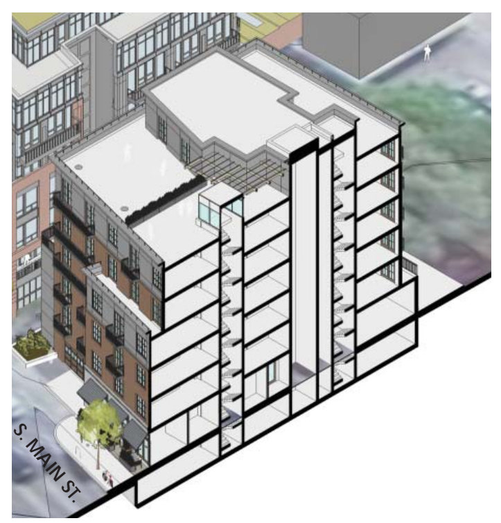
EAST/WEST 3D SECTION

THE MADISON ON MAIN 600 S. Main Street • Ann Arbor, Michigan