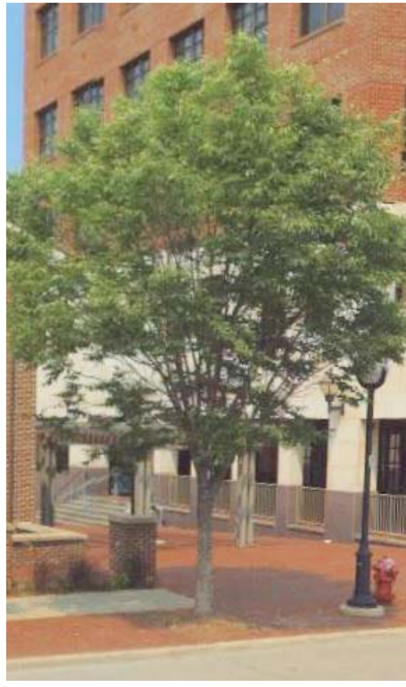
HONEYLOCUST STREET TREE

An open bottom storm water storage system under the building will allow storm water runoff to infiltrate into the soil. The design team plans to exceed the City's requirements for stormwater storage and infiltration.