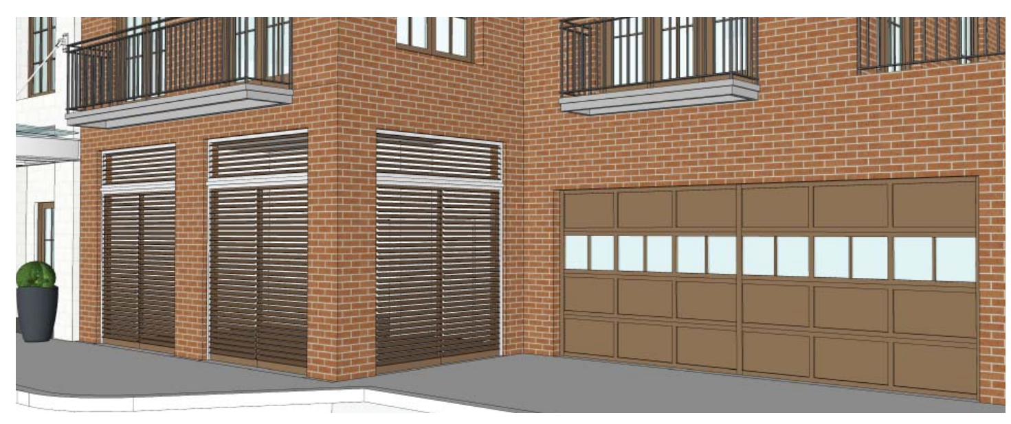
SERVICE DOORS & NORTH PARKING GARAGE ENTRANCE