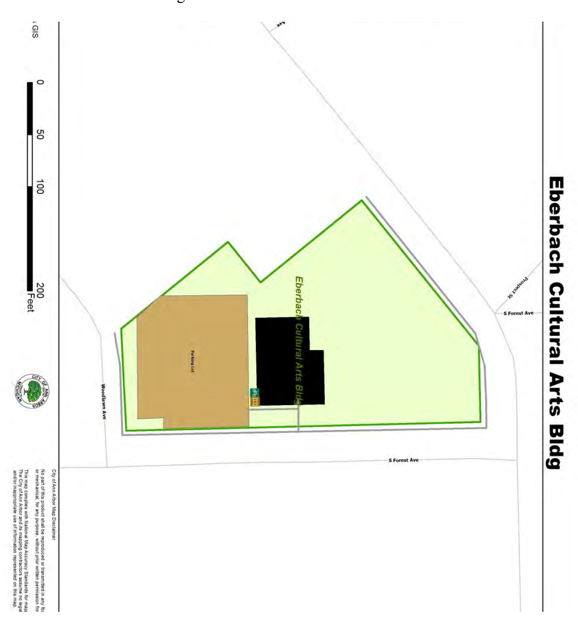
Exhibit C Diagram of Premises