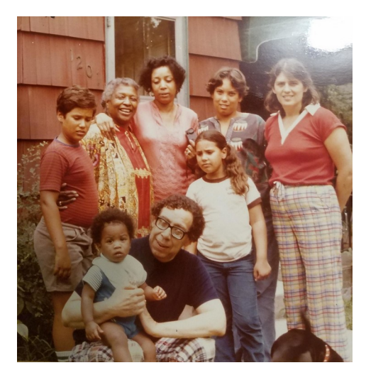
Undated family photo showing paint color scheme from the period of significance.

On the south facade, the main entrance to the building is through a steel door; the north (rear) entrance is wood. On the east bay of the