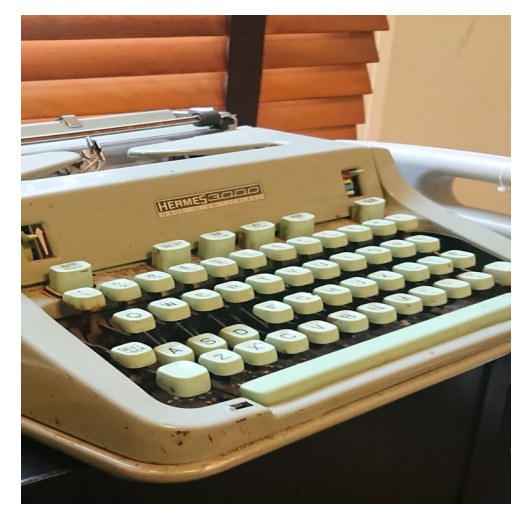
Mr. Hayden's typewriter in upstairs office.

An attached garage projects northwards from the rear of the house, its gable roof oriented perpendicular to that of the core building. A single, tilt-up garage door opens facing west onto Westminster Place, and is sheltered by a flat-roofed carport. The carport was added in 1957, according to building permits.