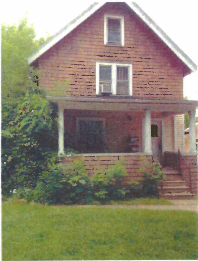
706 S 7 th 6-9-2016