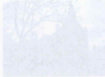
First Baptist Church 420 E. Huron