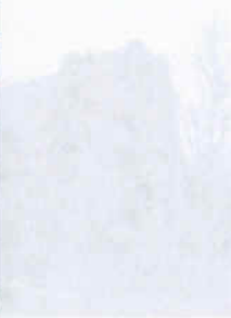
St. Paul's Lutheran Church