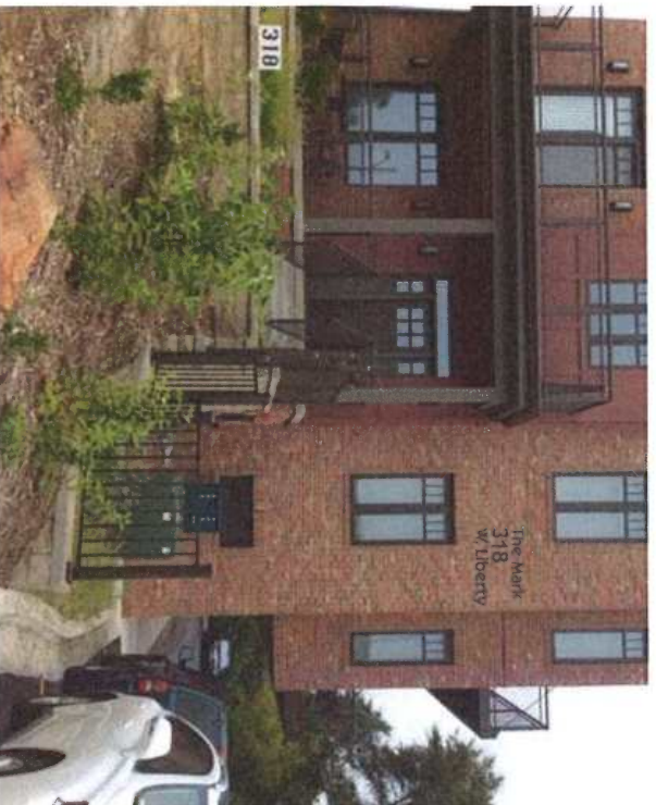
210" from the ground