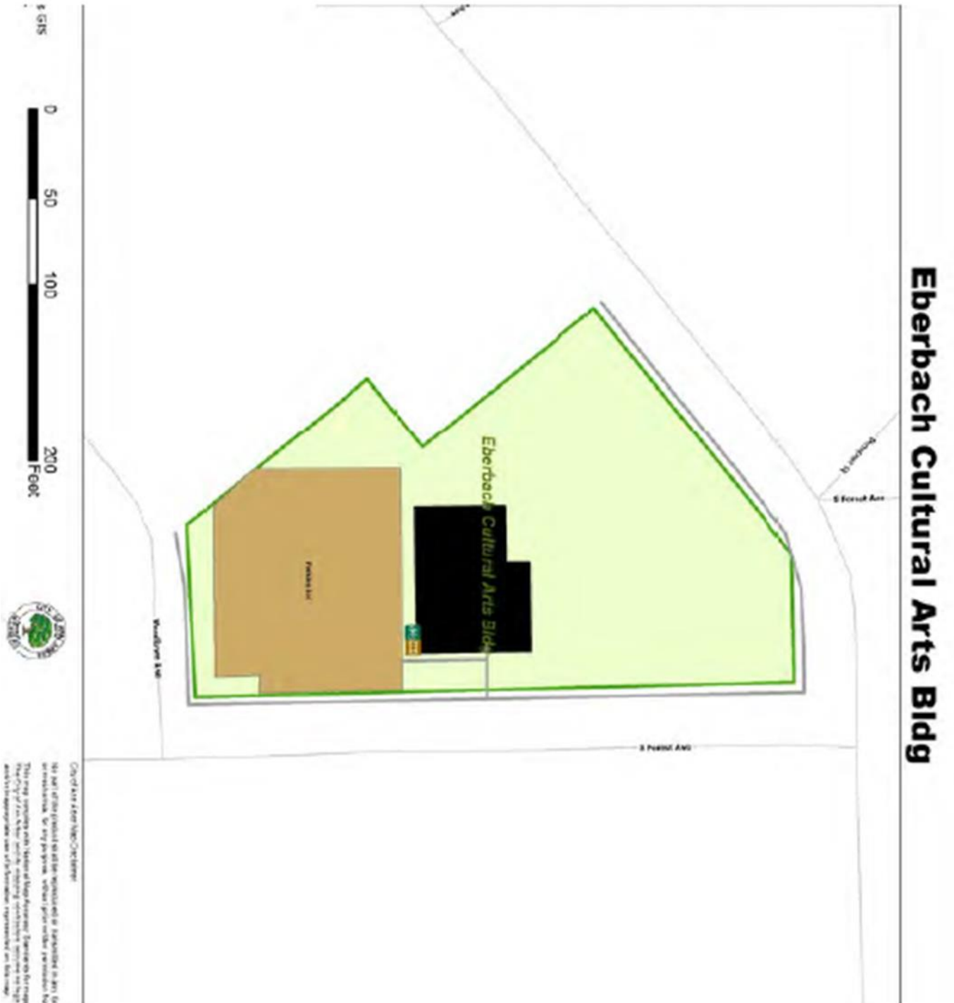
Exhibit C Diagram of Premises