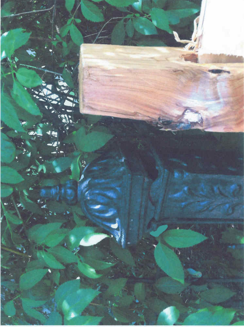
Where our new fence lines up with the existing fence on Madison