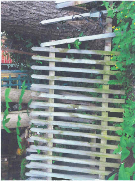
Our old fence