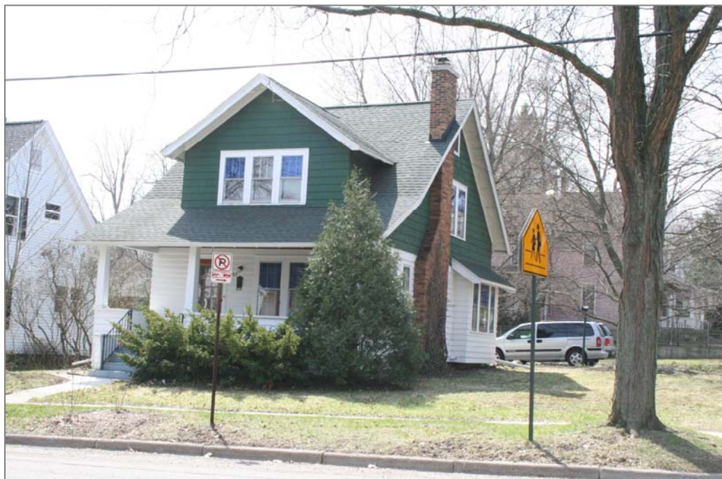
617 W Madison (April 2008)