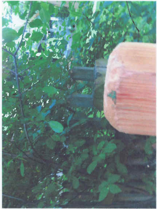
Where our new fence lines up with the existing fence on Fifth