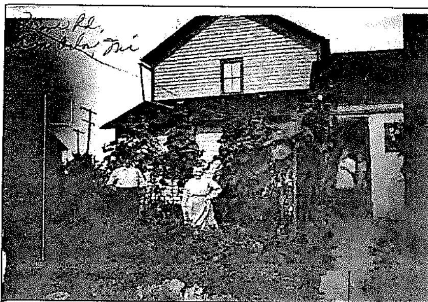
The Ritz family in front of 1137 Traver Street.