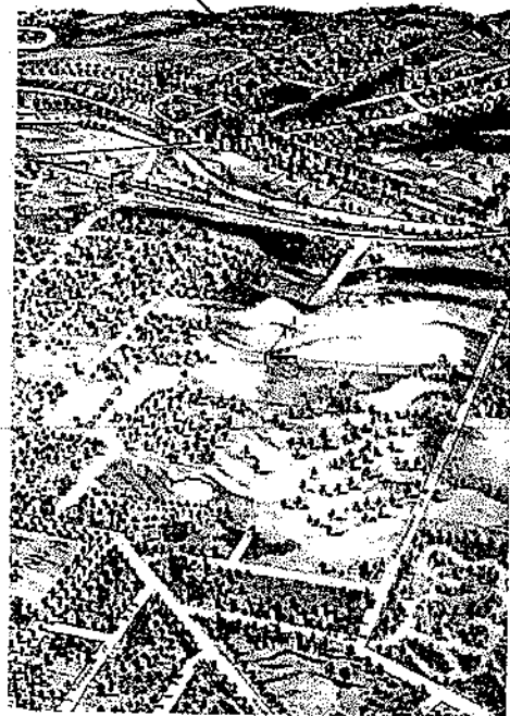
11 Traver St. in this 1866 bird's eye view of Ann Arbor.