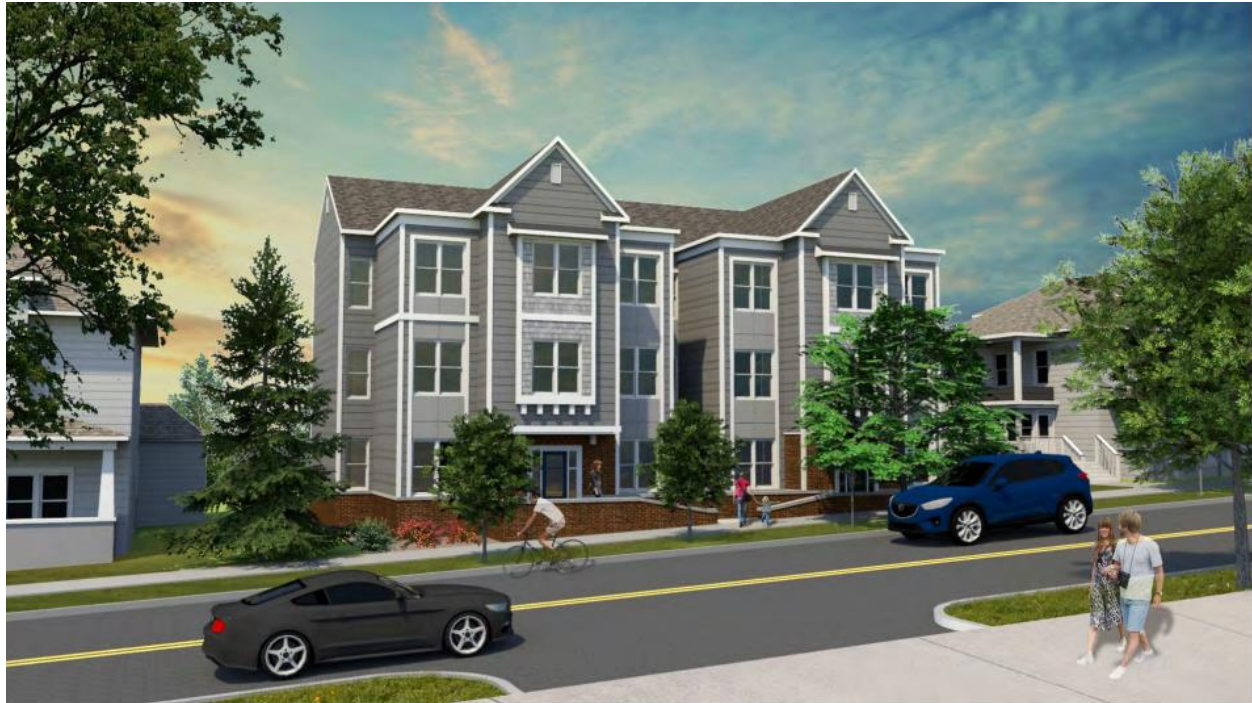
Figure 2 – 208 West Ann rendering

zoning district.” Their design “responds to the transitional character of the neighborhood” with its pitched, shingled roof, cementitious horizontal siding and double-hung windows. It is intended to fit well within the desired development style in the Kerrytown district.