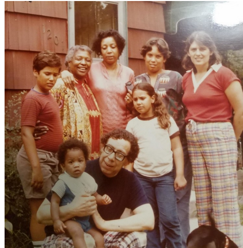
Undated family photo showing paint color scheme from the period of significance.

An attached garage projects northwards from the rear of the house, its gable roof oriented perpendicular to that of the core building. A single, tilt-up garage door opens facing west onto Westminster Place, and is sheltered by a flat-roofed carport. The carport was added in 1957, according to building permits.