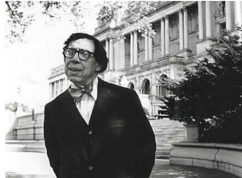
Undated photo of Robert Hayden.