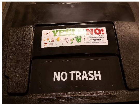
As part of our ongoing outreach on composting best practices, as of May 2020, the City is placing educational stickers on compost carts.

The 2020 compost season kicked off on April 6. While the start of the season has been unusual due to the COVID-19 pandemic (more on this below), the City was thrilled to see a surge in requests for residential compost carts. By the end of June, more than 800 new compost carts will be in circulation. To put things in perspective, that is more carts than a full day’s route.