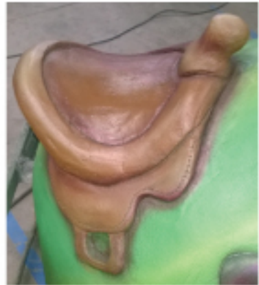
LSI GFRC sculptures