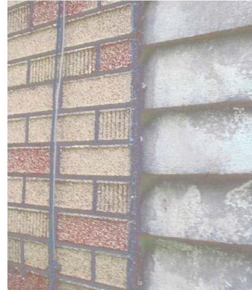
Artificial brick being removed