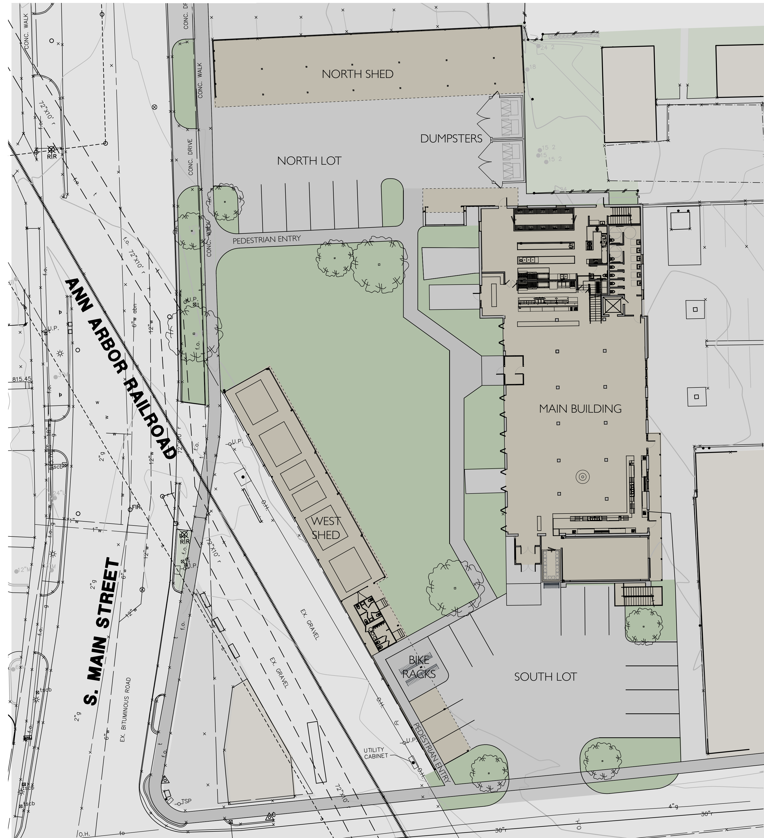
1 Site Plan SCALE: 1" = 20'-0"