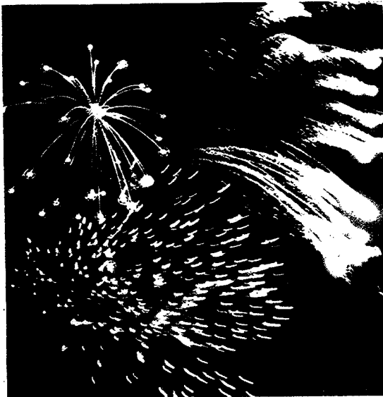
Fireworks Cascade Spectacularly Over Buhr Park

Ann Arbor, Michigan, Thursday, July 5, 1974