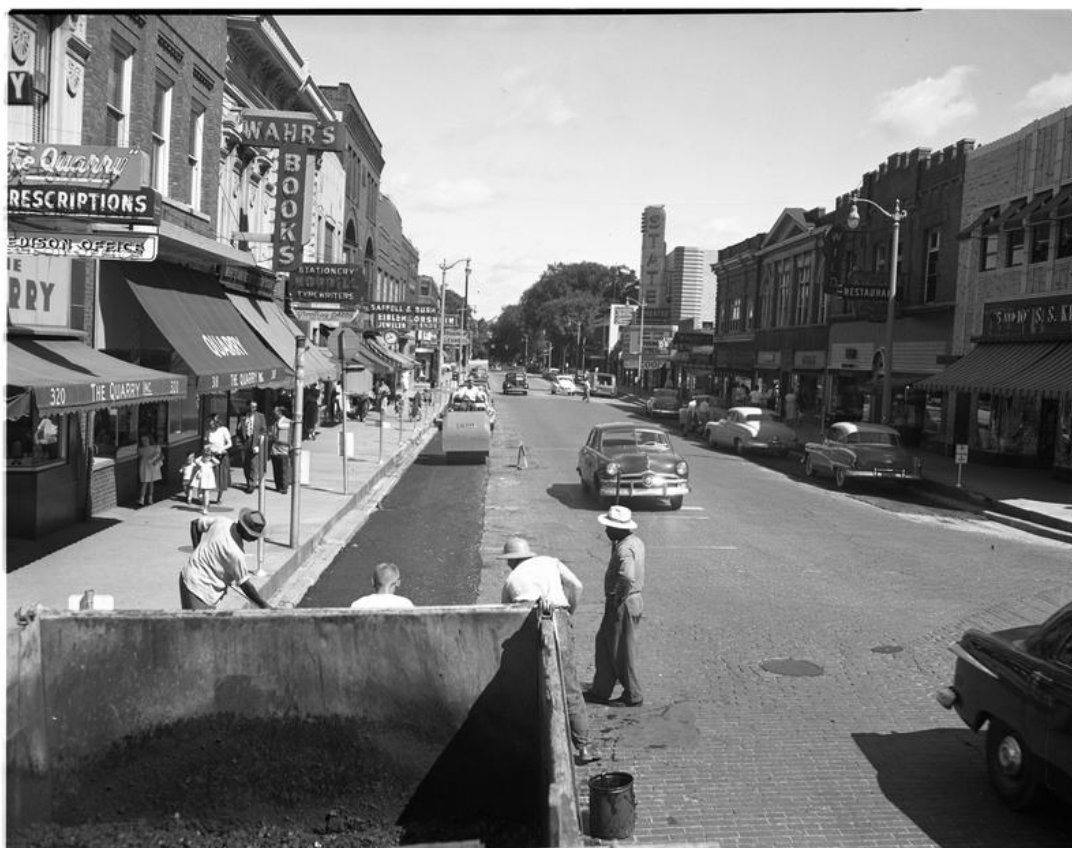
1951 Ann Arbor News photo, paving over the bricks on State Street. Kresge's is on the right. Note the upper floor awnings.