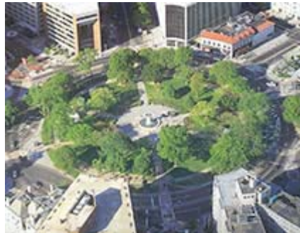
Older traffic circle