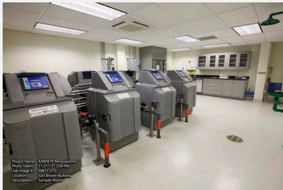
Project Name: AAWWTP Renovations Photo Taken: 11/21/17 - 2:04 PM Job-Image #: 48871-073 Location: East Blower Building Description: Sampler Room