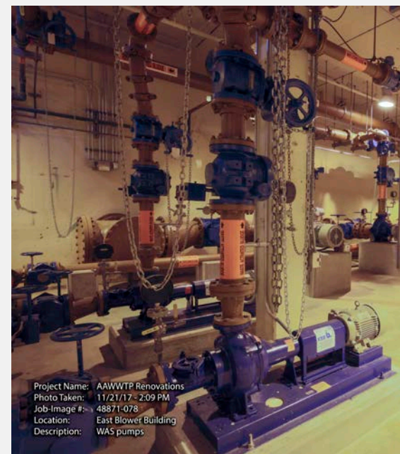
Project Name: AAWWTP Renovations Photo Taken: 11/21/17 - 2:09 PM Job-Image #: 48871-078 Location: East Blower Building Description: WAS pumps