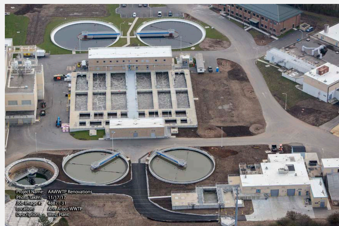
Project Name: AAWWTP Renovations Photo Taken: 11/17/17 Job-Image #: 48871-31 Location: Ann Arbor WWTP Description: West Plant