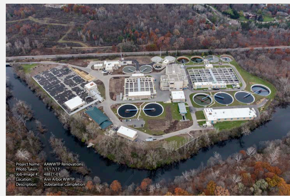
Project Name: AAWWTP Renovations Photo Taken: 11/17/17 Job-Image #: 48871-01 Location: Ann Arbor WWTP Description: Substantial Completion