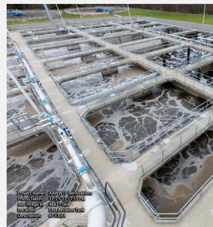
Project Name: AAWWTP Renovations Photo Taken: 11/21/17 - 1:55 PM Job-Image #: 48871-064 Location: East Aeration Tank Description: AT-E3/E4