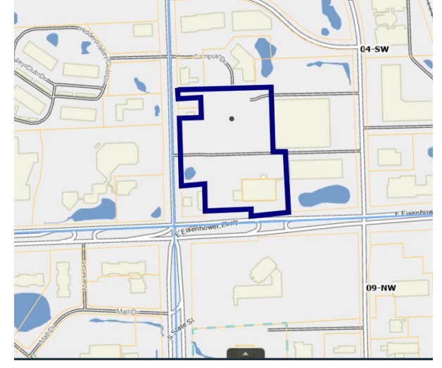
Figure 1: 2845 South State Street location

In 1972, the City obtained a deed over a 50-foot wide area adjacent to East Eisenhower Parkway over 2991 and 2845 South State Street. In 1985, the area was deeded back to 2991 South State Street but did not include 2845 South State Street.