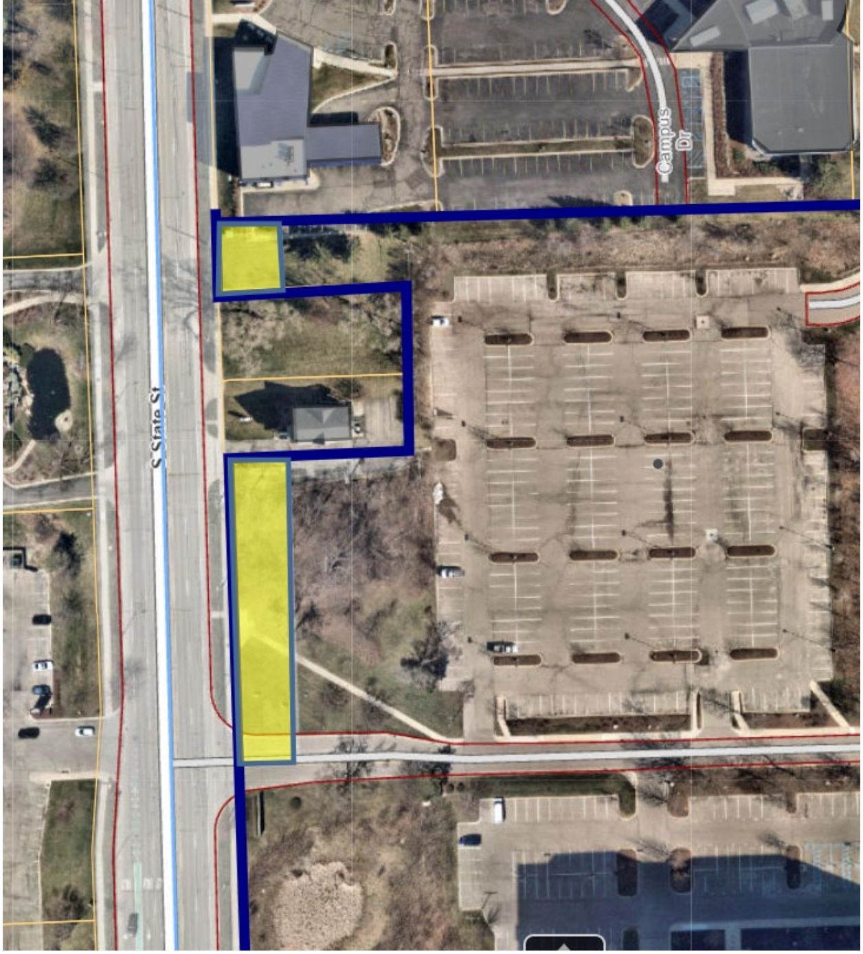
Figure 2: Detail of 50'x51' (top) and 50'x229' (bottom) areas along South State Street requested for release.

Below is an image showing the two segments along South State Street, a 50-foot-wide by 51-foot-long area (top yellow box) and a 50-foot-wide by 229-foot-long area (bottom yellow box), to be released back to 2845 South State Street. An area extending below/south of the lower, larger box has already been released.